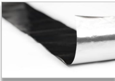
KISO 501 ALU-BUTYL with black butyl

KISO 501 ALU-BUTYL is a more economical solution for applications not requiring high-tear resistance properties such as sealing duct flanges in HVAC systems, or seals in areas not exposed to the environment. It is a quick and easy way to carry out temporary remedial work.