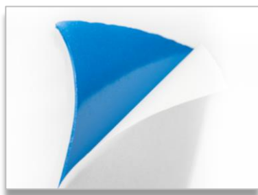
KISO 458 BUTYL Superior, blue

KISO 458 BUTYL Tape is supplied as rectangular or round profiles, available in numerous dimensions and a choice of four colours. It has high tack qualities and provides good adhesion to metal, glass, wood, concrete and composite materials.