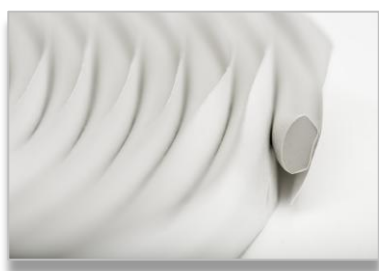
KISO 354 BUTYL High Tack bead, grey